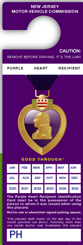
For Purple Heart recipients, present