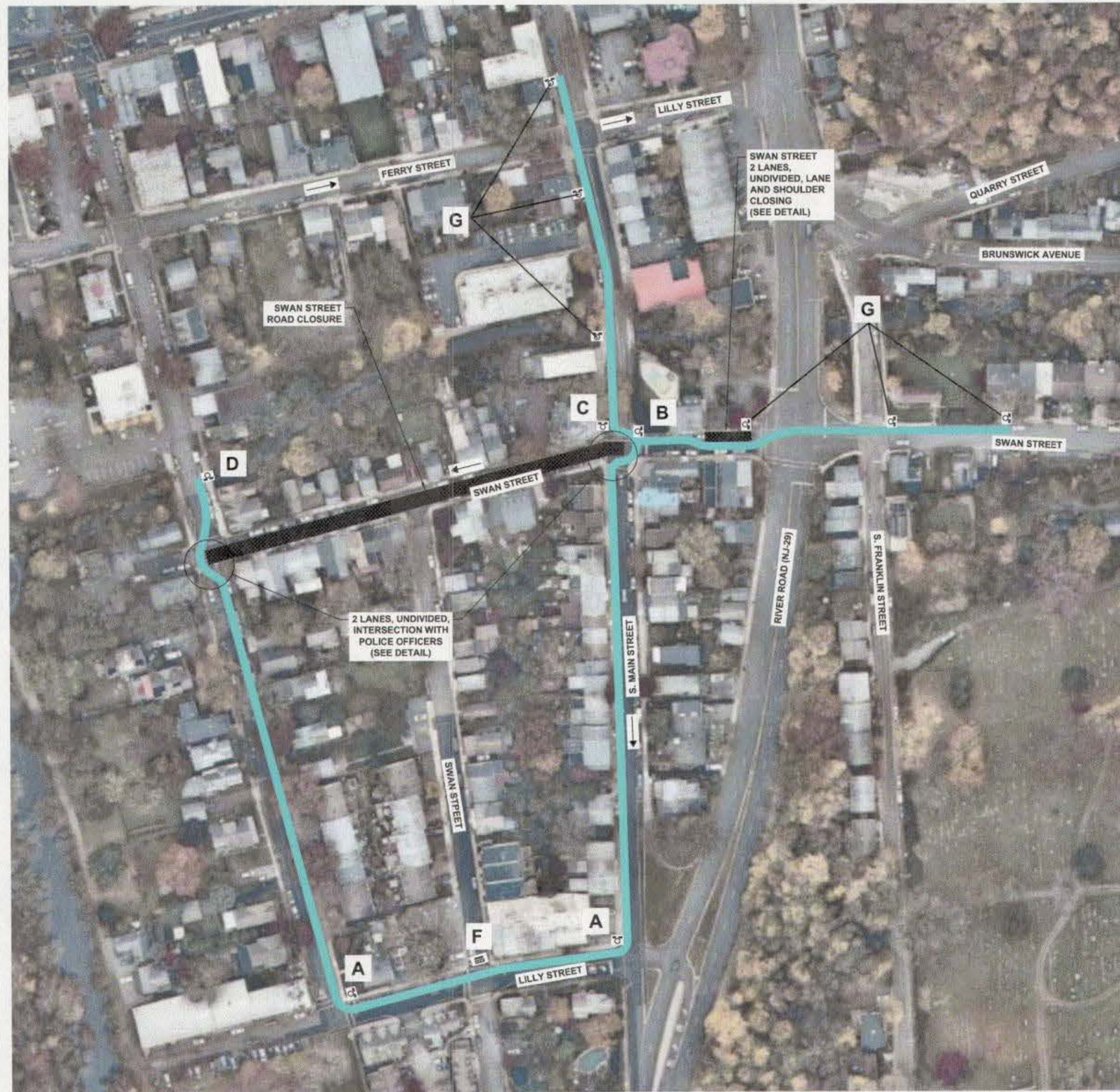
SWAN STREET TRAFFIC DETOUR PLAN I SCALE: 1" = 80'

E:\SCE\ Lambertville\10130 Sewer Rehabilitation\Sheets\10130.021 07-10 Traffic Detour Plans.dwg Fri, Mar 29, 2019 - 2:10pm JFowler SUBURBAN CONSULTING ENGINEERS, INC.