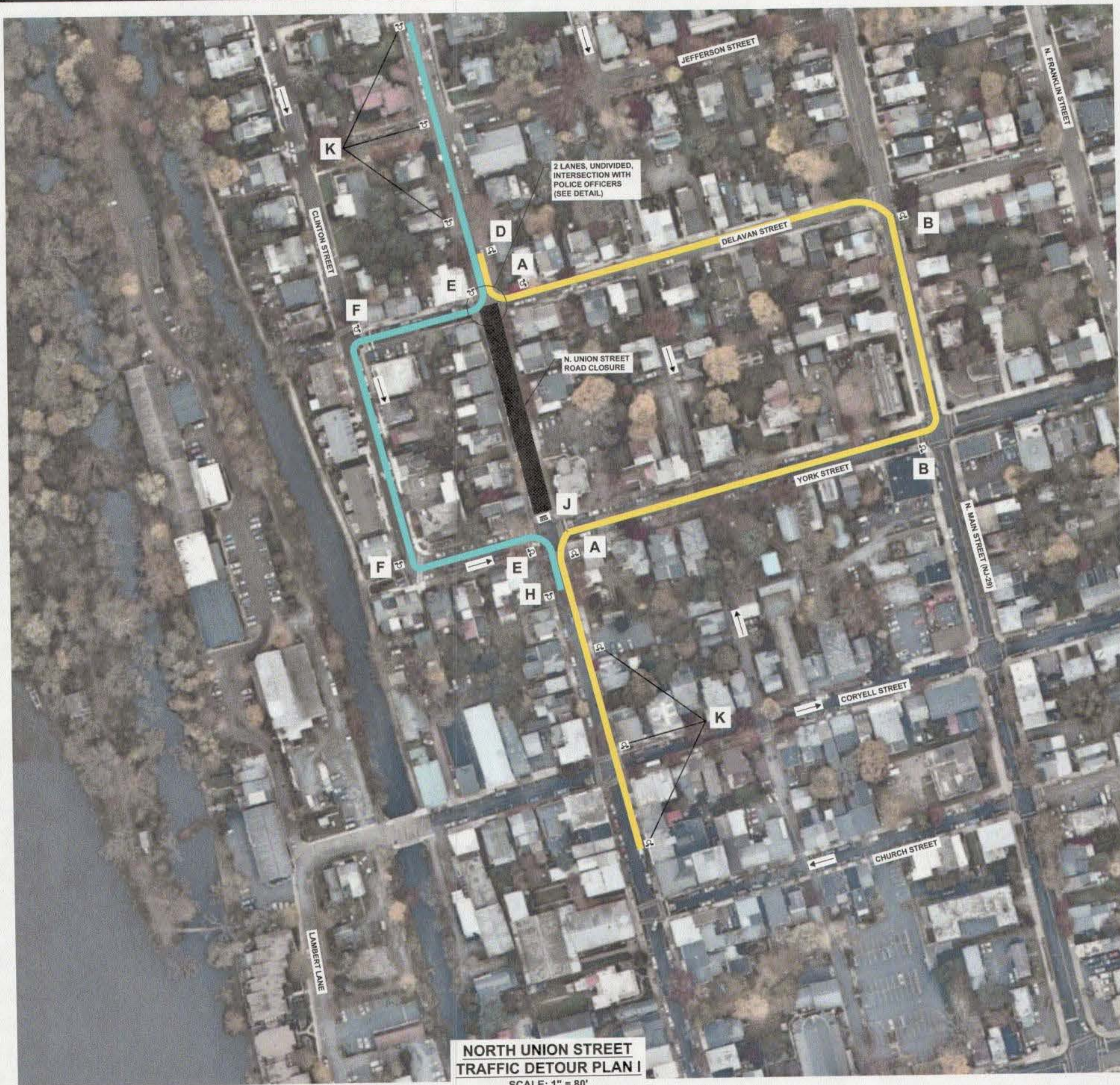
NORTH UNION STREET TRAFFIC DETOUR PLAN I SCALE: 1" = 80'

E:\SCE\10130 Lambertville\10130 Sewer Rehabilitation\10130.021 07-10 Traffic Detour Plans.dwg Fri, Mar 29, 2019 - 3:38pm jfowler SUBURBAN CONSULTING ENGINEERS, INC.